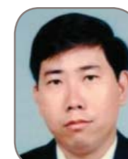
Sokhom Pheakavanmony Secretary of State Ministry of Public Works and Transport, Kingdom of Cambodia