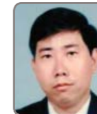
Sokhom Pheakavanmony Secretary of State Ministry of Public Works and Transport, Kingdom of Cambodia