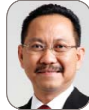
Bambang Susantono Vice Minister of Transportation Ministry of Transportation, Indonesia